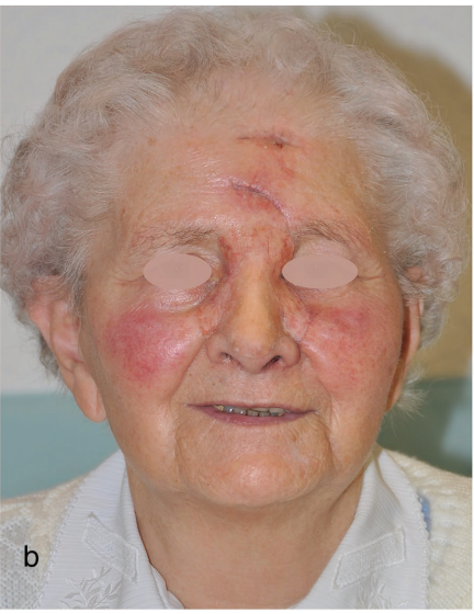
Figure 3 Findings five weeks postoperative. Scars between skin and mucous membrane without irritation (a). Findings with nasal epithesis (b).